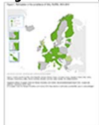
Figure 1. Participation in the surveillance of SSIs, EU/EEA, 2013–2014